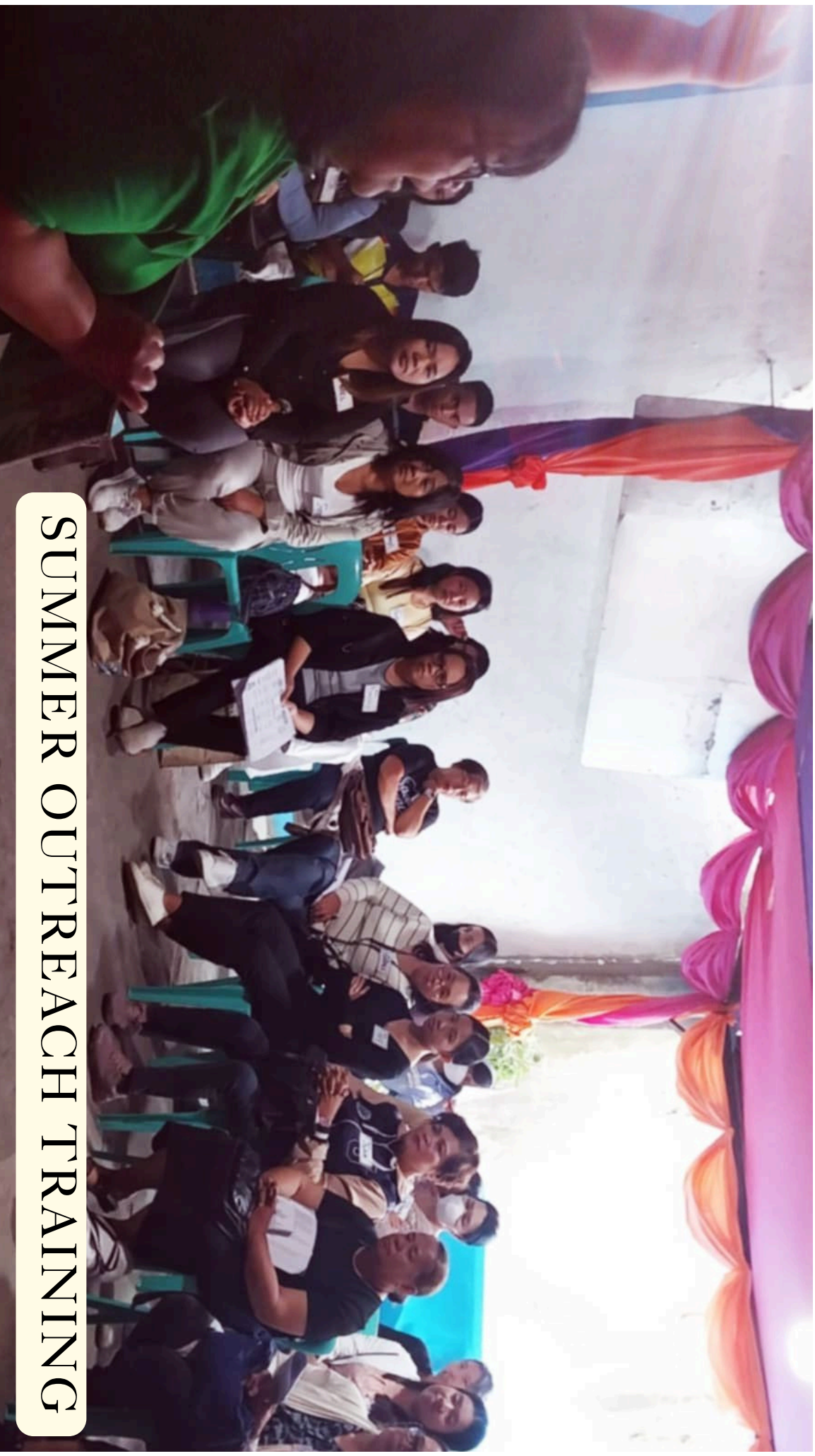
SUMMER OUTREACH TRAINING