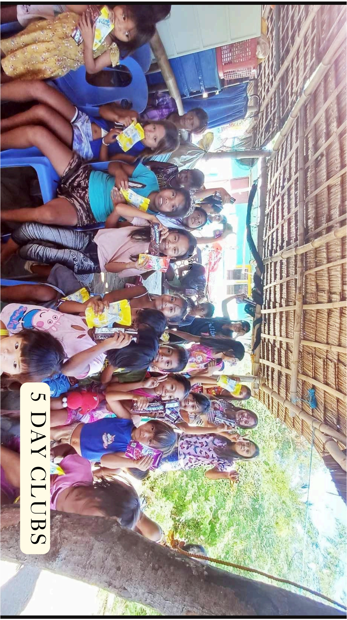
5 DAY CLUBS